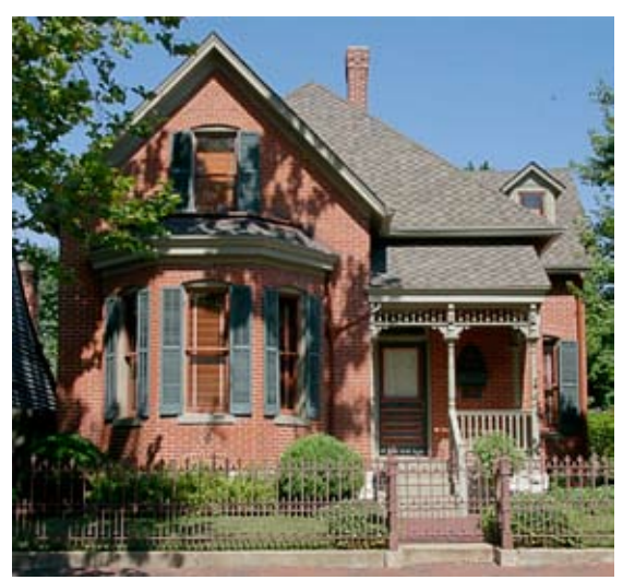
715 South Main